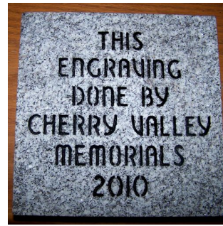
Example 8" X 8"

Plans include a plaza and "Tribute Walk" flanked by the two cannons that have been gracing the front of the historic edifice for decades.